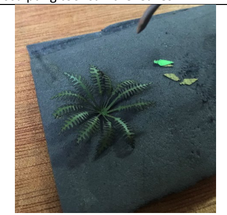
Step 5. Ready for planting.