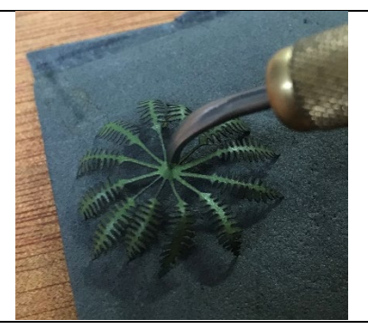
Step 3. Turn the spider over and force the centre into the foam