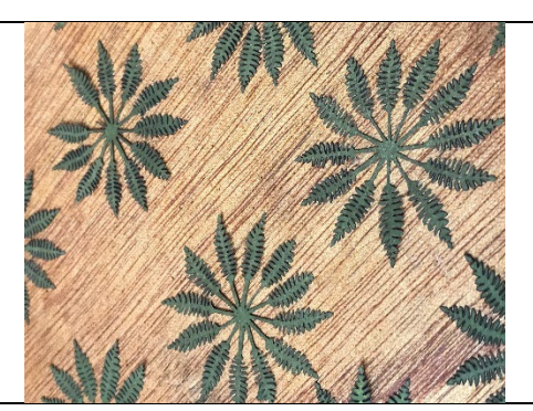
Step 1. Carefully remove the ferns from the waste.