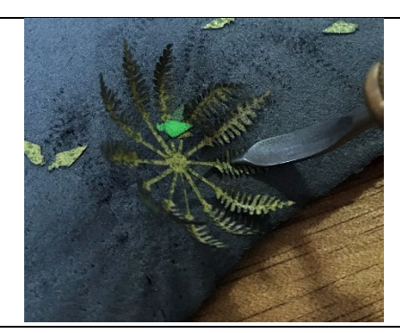
Step 2. Using a soft foam mat and a smooth sculpting tool curl the leaves.