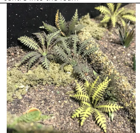
Step 6. Ferns can be planted using white glue. The spiders can also be stacked to