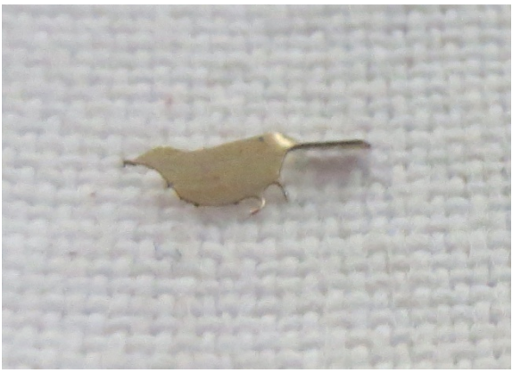
3. Twist the body and tail 90°