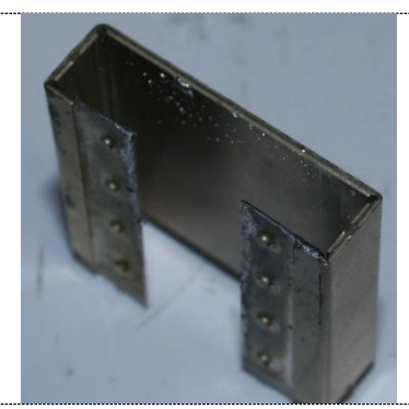
Fold the housing 90° to form and box section