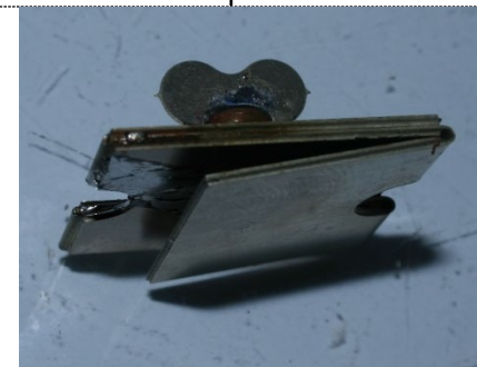
Fold the spring 180° <u>toward</u> the etched line This forms the spring plate