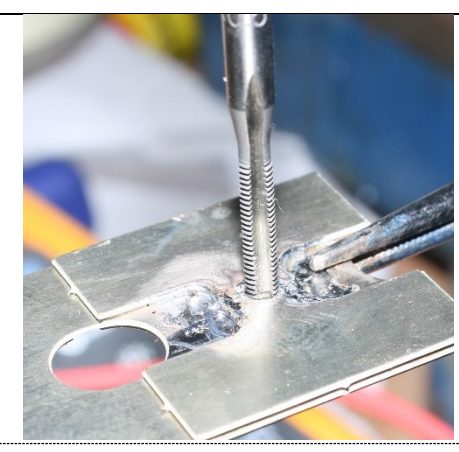
Solder and tap the hold to M3