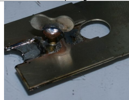
Add the butterfly wings to a M3 screw