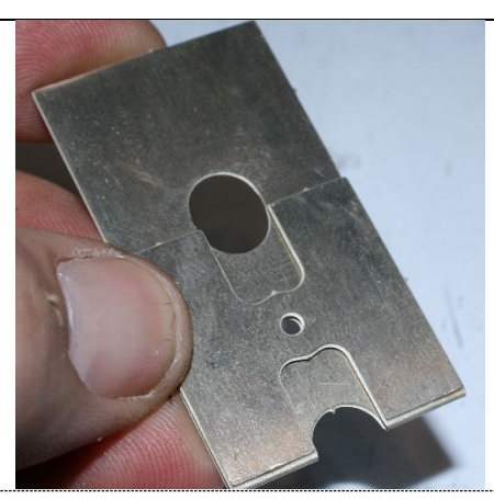
Remove the butterfly wings then fold 180°