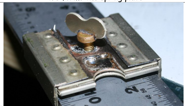
Insert the 2 halves, use rulers to force the spring up and solder the sections together. Remember to remove the screw!!