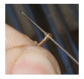
Ream the hole in the hook