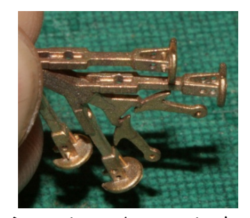
Drag pin can be seen in the top head