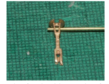
The fit should be tight if loose change to larger wire