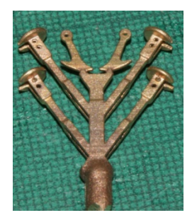
The sprue 2 pairs of couplers