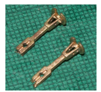
Remove a pair of heads from the sprue, one with a drag pin one without