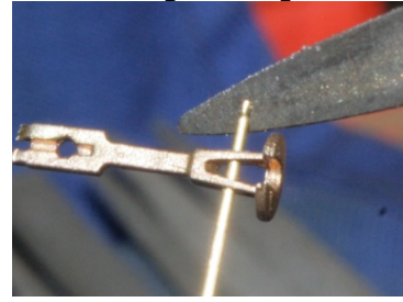
File the end