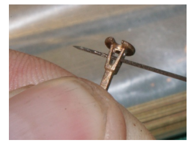
Ream the rear hole in the head until the 0.5mm wire fits