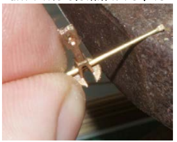
So it doesn't escape